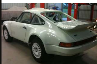
JEFF DAVID'S PORSCHE 911