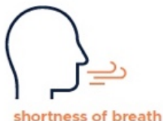
shortness of breath