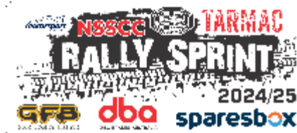
Bumper Sticker (Not Compulsory)